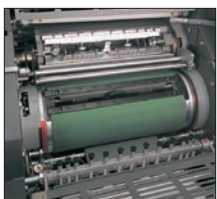
Plate clamps accept both pin bar and straight edge plates. Use metal or polyester material.

A bridge roller between the water and ink units makes roller cleaning quick and easy.