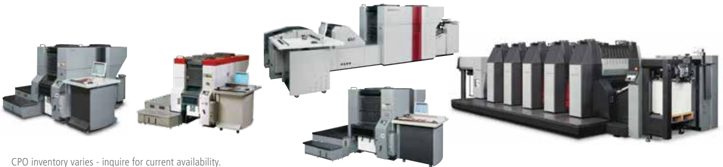
CPO inventory varies - inquire for current availability.